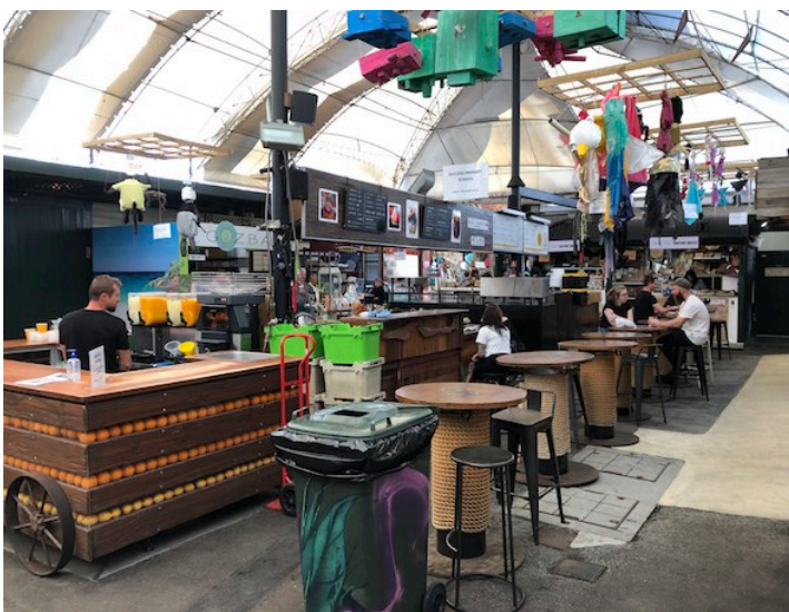
TYPE TO ENTER A CAPTION.