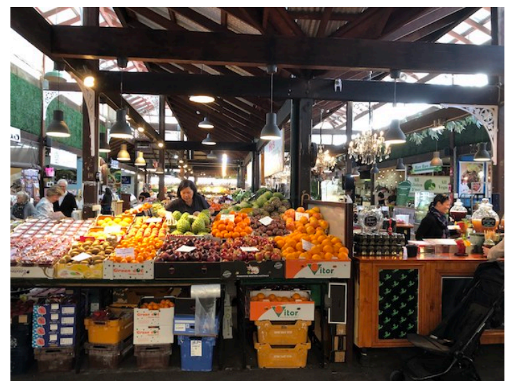
TYPE TO ENTER A CAPTION.