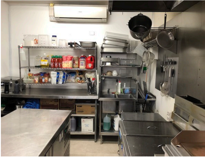
TYPE TO ENTER A CAPTION.