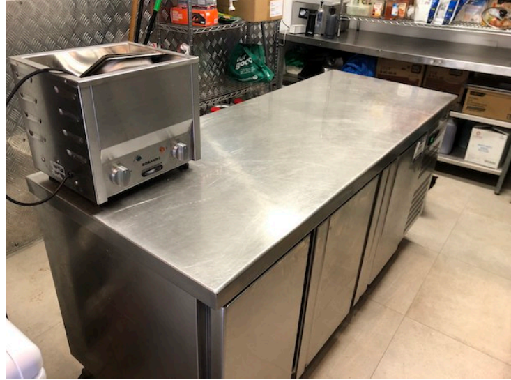
TYPE TO ENTER A CAPTION.