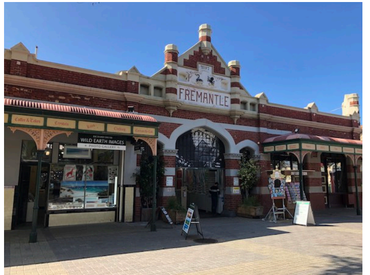
TYPE TO ENTER A CAPTION.